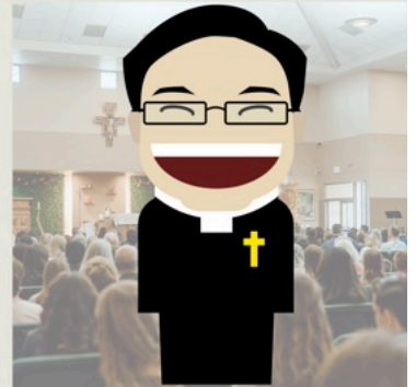
SHEPHERD | 2023