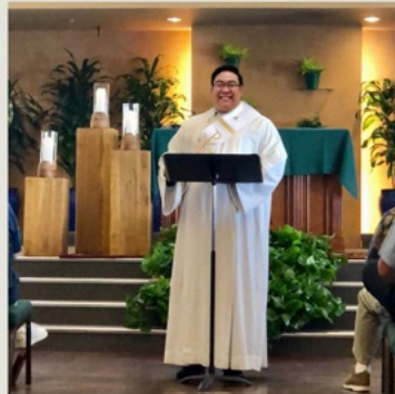
DEACON | 2018