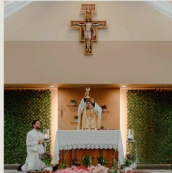
PRIEST | 2019