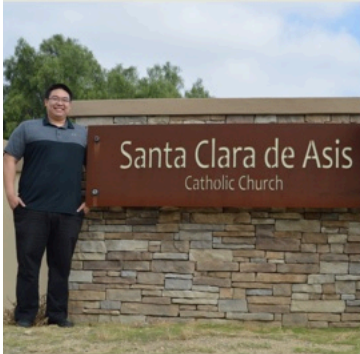
SEMINARIAN | 2017